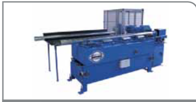
Spiro ® Speed Carrier (SSC)