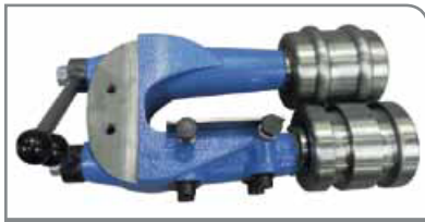
Standard Corrugation Unit

Produce ducts with smooth inside surface at the ends but reinforced with corrugation