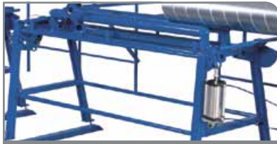
Standard Run-off Table

duct length up to 3m, including automatic discharge