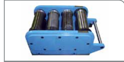
Form Roll Unit (FRU)

Standard unit with highest steel quality rollers