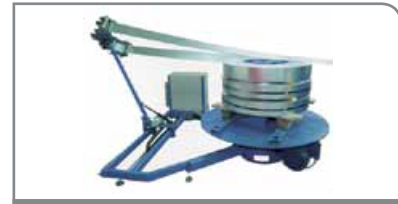
Horizontal Decoiler DCH-3000

duct length up to 3m, including automatic discharge