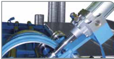
Automatic Corrugation Unit

User-friendly display featuring interface to network and internet, diagnosis tool and multilingual function