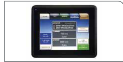
State-of-the-art User Interface

User-friendly display featuring interface to network and internet, diagnosis tool and multilingual function