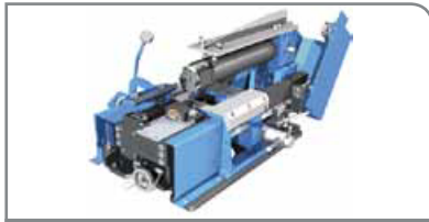
Slitter Model H

Standard unit with highest steel quality rollers