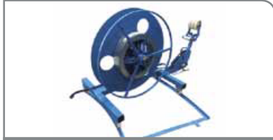
Vertical Decoiler DCV-1000

Standard decoiler with max. 1000 kg loading capacity